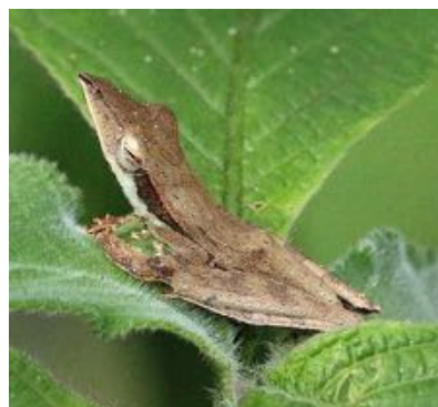
Unknown Frog - Sinharaja