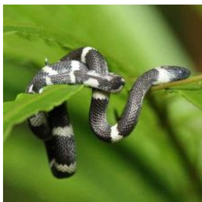
Common Wolf Snake