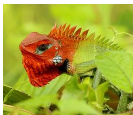
Green Forest Lizard