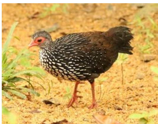
Sri Lanka Spurfowl