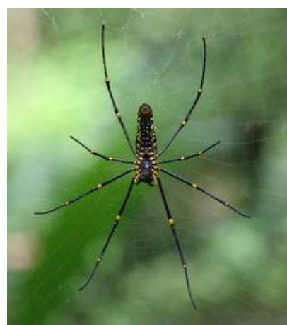
Giant Wood Spider