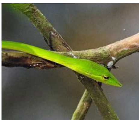
Green Vine Snake