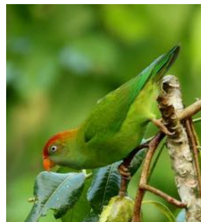
Sri Lanka Hanging Parrot